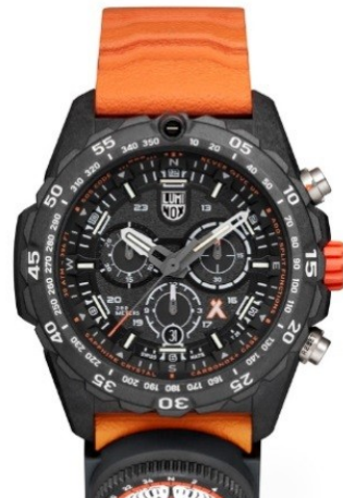
BEAR GRYLLS SURVIVAL 3749 SGD $1420 before GST