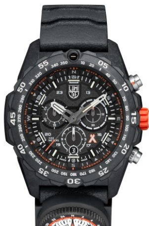
BEAR GRYLLS SURVIVAL 3741 SGD $1420 before GST

One distinctive feature of the Luminox Bear Grylls Survival 3740 Master series is the CARBONOX™+ case material, as compared to the CARBONOX™ found on the Luminox Bear Grylls Survival 3720. CARBONOX™+ is a high performance carbon long bar compound, in which carbon fibers account for 40% of the compound. In addition to the many consumer benefits already provided by CARBONOX™ , CARBONOX™+ also delivers ones such as an ultra-strong watch case, improved tensile strength, 3 times less water absorption and a very modern and distinctive gray color imparted onto the Luminox watches.