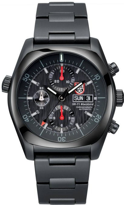
9082 BO – day shot