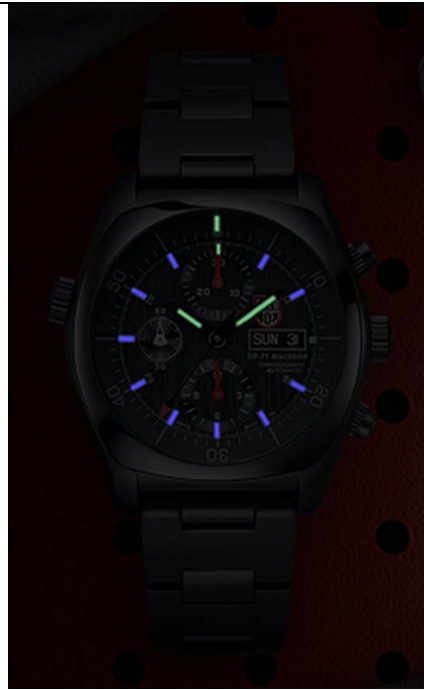
9082 BO – night shot