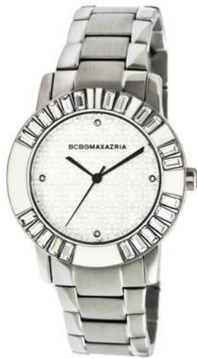
IBG8289 Retail Price: S$209 (before GST)/ S$224 (with GST)