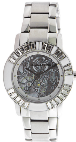
IBG8292 Retail Price: S$349 (before GST)/ S$373 (with GST)