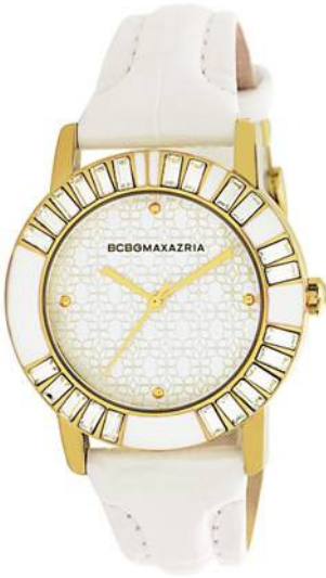
IBG6404 Retail Price: S$195 (before GST)/ S$209 (with GST)