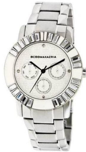
IBG8291 Retail Price: S$245 (before GST)/ S$262 (with GST)