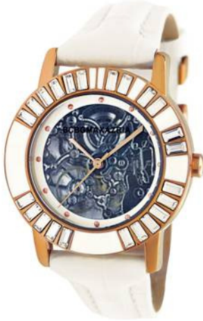
IBG6408 Retail Price: S$319 (before GST)/ S$341 (with GST)