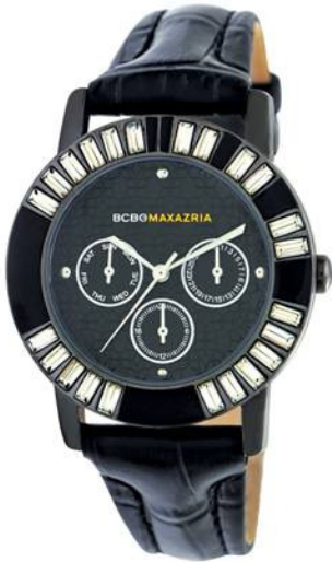
IBG6405 Retail Price: S$225 (before GST)/ S$241 (with GST)