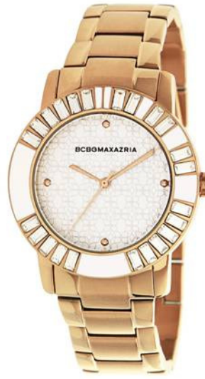
IBG8290 Retail Price: S$229 (before GST)/ S$245 (with GST)