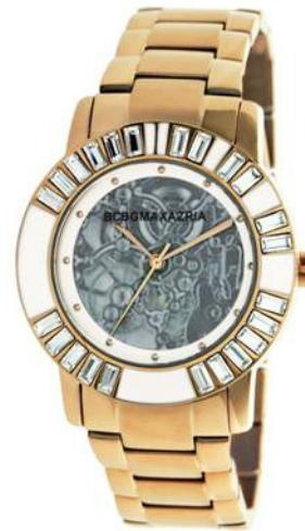
IBG8293 Retail Price: S$369 (before GST) S$395 (with GST)