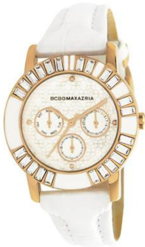
IBG6406 Retail Price: S$225 (before GST)/ S$241 (with GST)