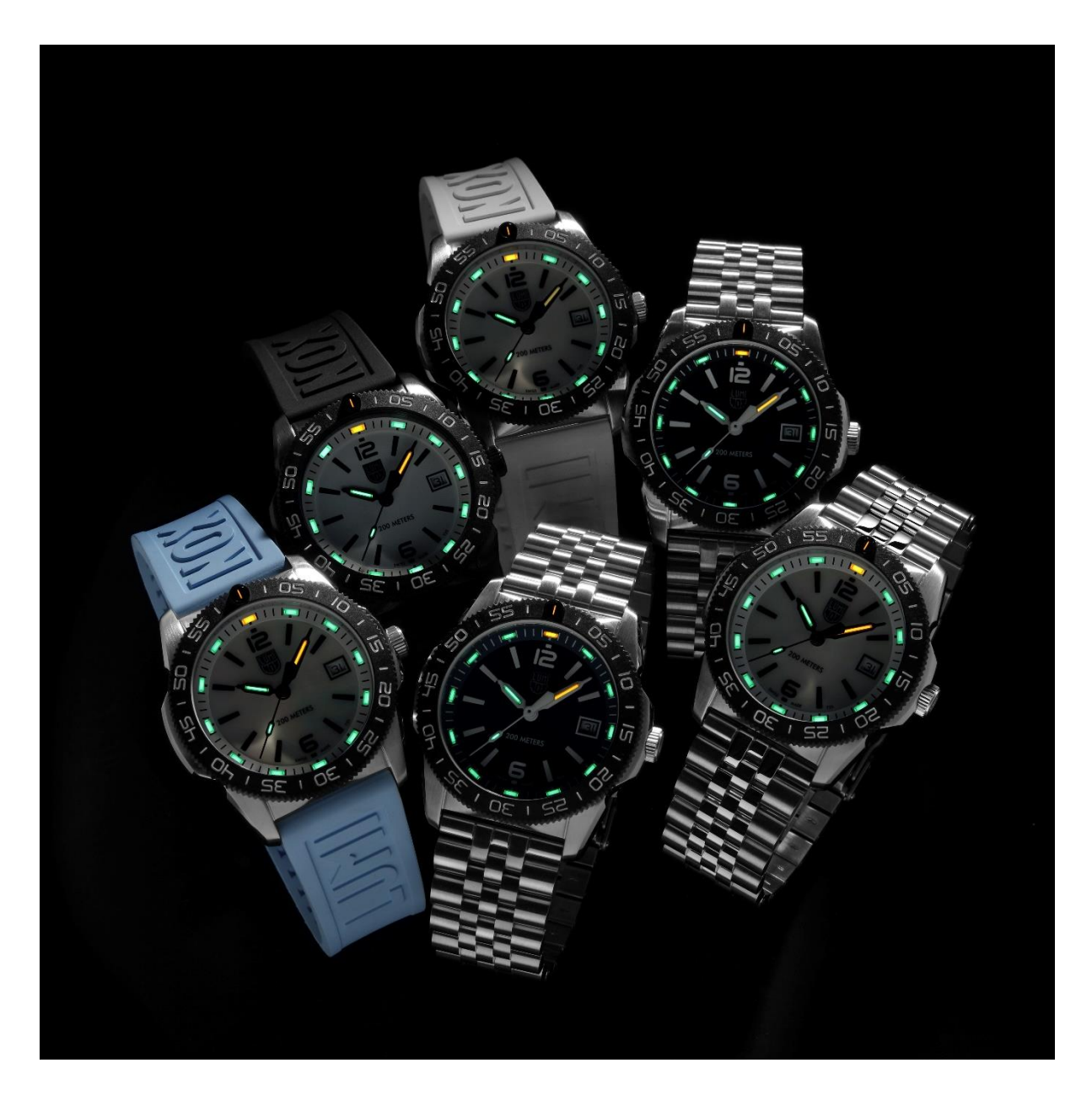
Arriving with a total of 6 variations, The Luminox Pacific Diver Ripple will come equipped with different design and colour features depending on one's preference and style, while

May 2023 – Luminox is making waves in 2023 by broadening one of our best sellers, the Pacific Diver Series. Riding in at a 39mm diameter case size, the new Luminox Pacific Diver Ripple Series appeals to a wider range of casual explorers and aquatic aficionados alike, all while staying true to Luminox's DNA and brand identity. Luminox rarely designs watches with case diameters in their 30s, and we hope that this new trend will help to catch the eyes of both the men and women.